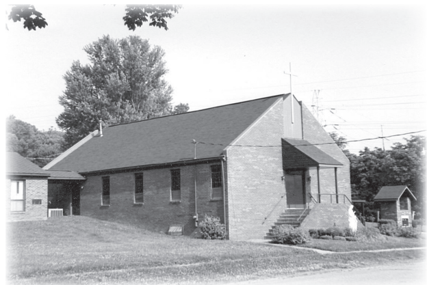
St. Ann Church in 2004, with a corner of the new parish hall

A small education and activities building, standing southwest of the church, was